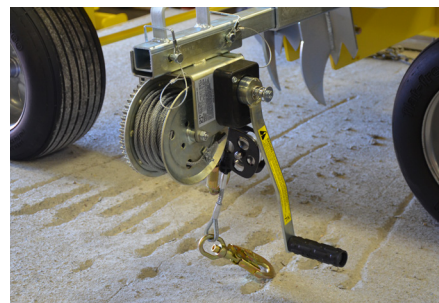
Rescue Winch Aid in retrieval of fallen workers.