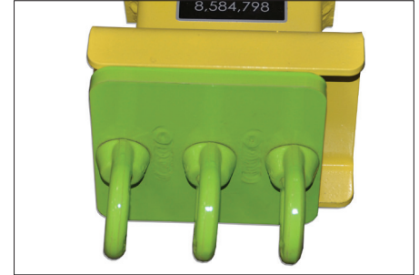
Cobra Cart™ Anchor Points yellow = fall restraint green = fall arrest