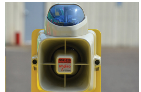
Fall Alert Warn other workers a fall has occurred.