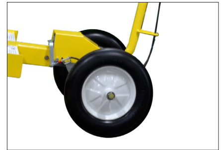
Flat-free rubber tires.