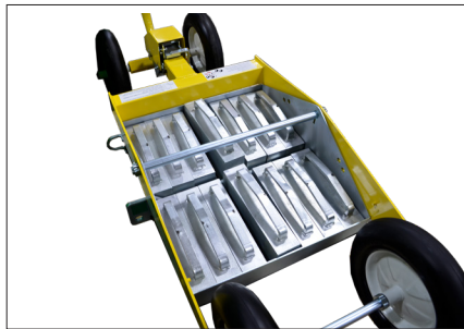
Cast weights or cans available.