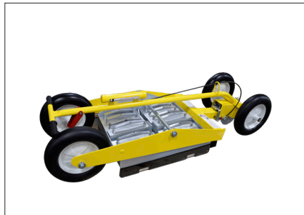
Press handle release and lower weights into working position.