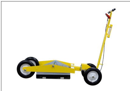
Move LifePoint™ Duo handle into travel position. Move unit into position.