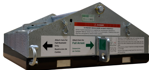
Tie off points for Fall Arrest

With galvanized and powder coated corrosion resistant components and few moving parts, LifePoint™ will perform for years.