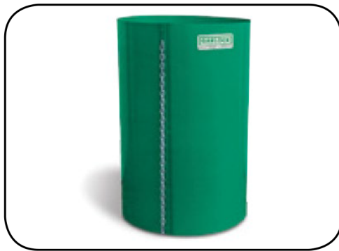
Trash Chute Lightweight and wear resistant. Stores flat.