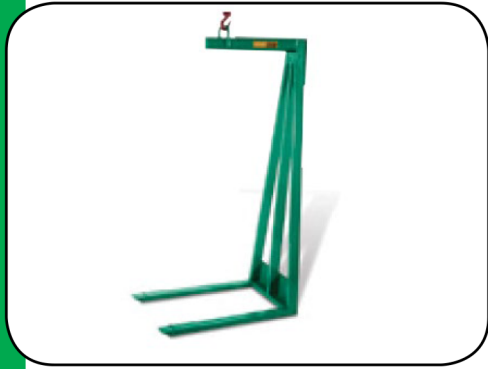
Host Hook Fork width of 24.25", 2,000 lb. capacity.