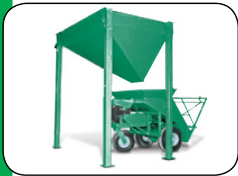
788 Gravel Hopper 40 cu.ft capacity with adjustable legs.