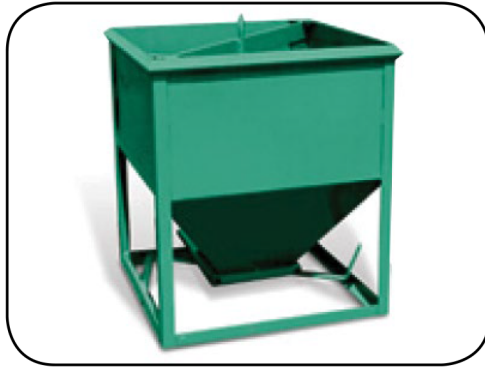
Gravel Bucket Easy open gate with 1100 lb. capacity.