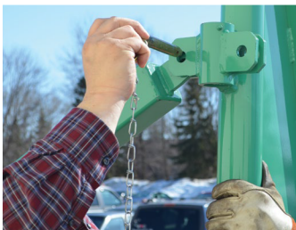
Easy Pin Assembly of Sections