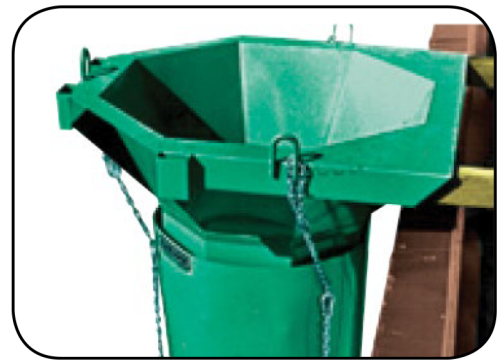
Trash Chute Hopper Rugged addition to chute.