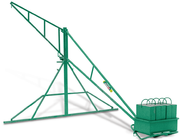
400 lb. Hand Hoist

Quickly lift lightweight mechanical equipment, tools, materials and other objects to rooftop worksites. Easily supports loads up to 300 Lbs. when used with the optional counterweight system..