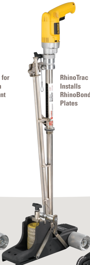
RhinoTrac Installs RhinoBond Plates