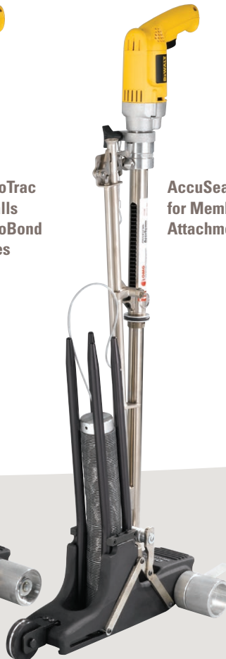
AccuSeam for Membrane Attachment