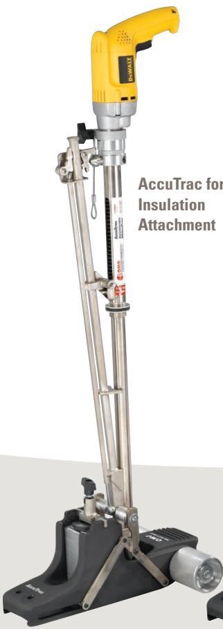
AccuTrac for Insulation Attachment

RhinoTrac eliminates over- and under-driving of RhinoBond plates for optimal welding of thermoplastic membranes.