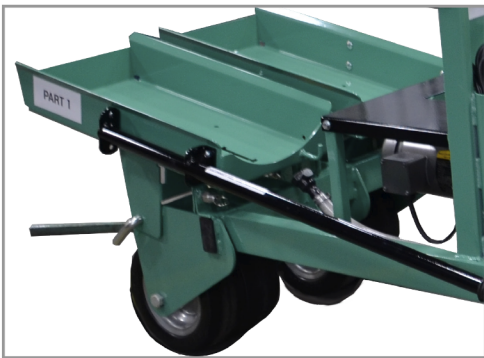
Easy loading barrel trays with pivot: barrel trays easily removed to reduce