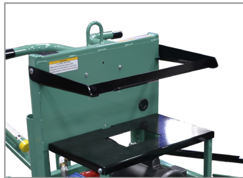
Optional Mounting Kit for Honda Generator